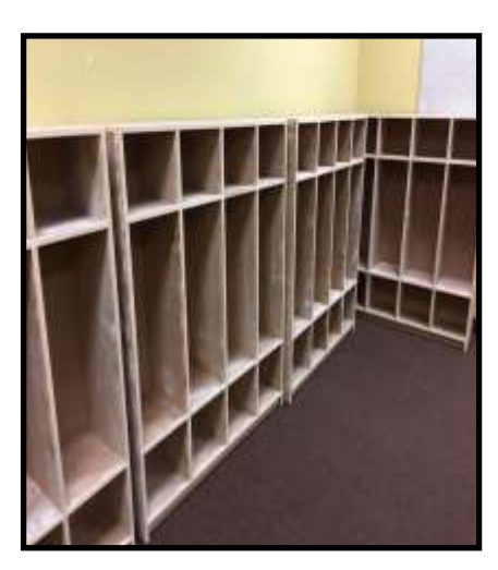
Sixteen preschool Cubbies designed and built from scratch.

Adults, youth, and children are working to ensure a safe and welcoming preschool for future families. Here are just a few of the shared projects: Hallway Cubbies, Photography Documentation, Facebook & Webpage Communications, Gardens, Outdoor Playground, Seed Packets & Informational Mailings, and Supply Donations.