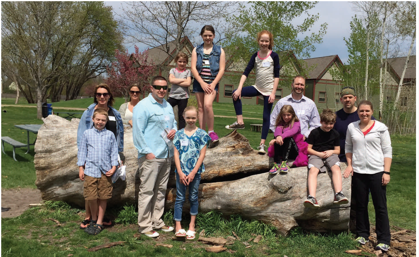
5th Grade Earthcare Milestone—April 24, 2016