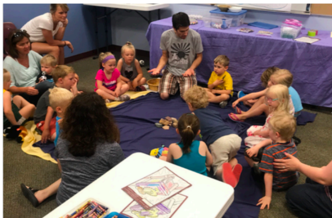
Preschool VBS was a blast!