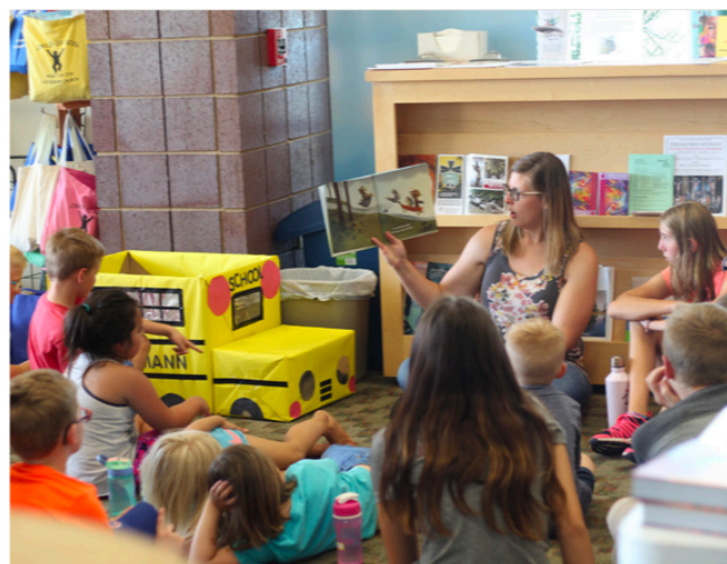
Many laughs and smiles throughout Day Camp.

Thank you to everyone who planned events, shared food, taught children and adults, loved and cared for God's creation, and loved and cared for one another and our neighbors. God is good!