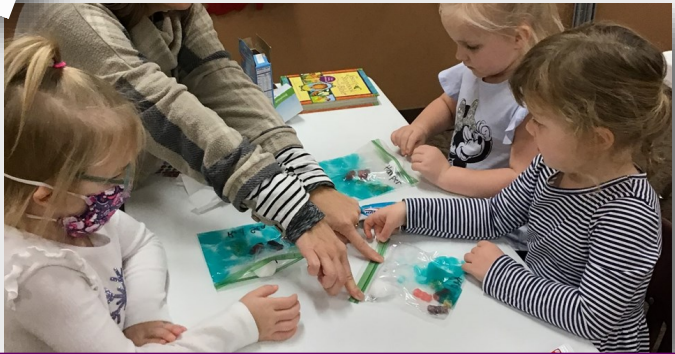
The story of Moses crossing the Red Sea told with toothpaste, pasta fish, and stickers