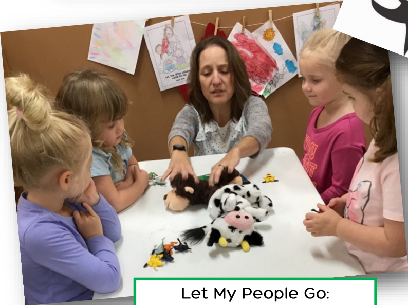
Let My People Go: The Plagues