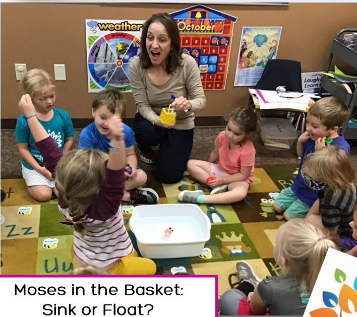
Moses in the Basket: Sink or Float?