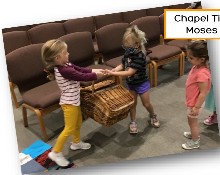
Chapel Time—God helped Moses in the basket.