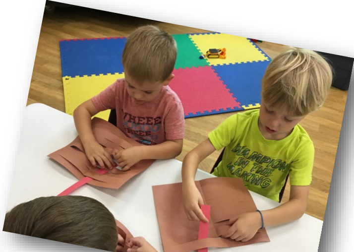
Weaving a Basket for Moses