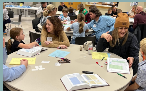
Milestone Fun: Pictures Left to Right

4-year-olds “Walking with Jesus”; 2-year-olds “My Church”; 3rd Grade Bibles