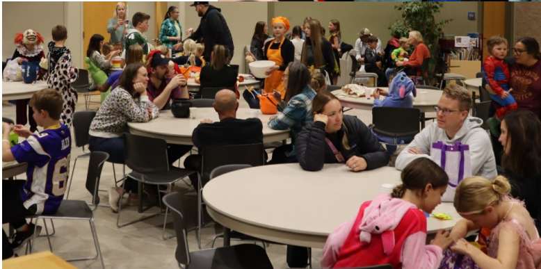
We had a great turnout for our annual indoor trunk-or-treat! Thank you to all the confirmation students and volunteers who helped make it a wonderful night for our children!