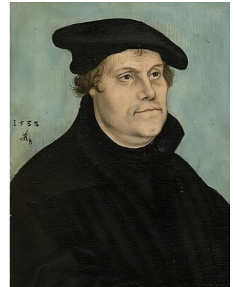
Martin Luther by Lucas Cranach

The "mighty fortress" metaphor draws on this context. It conveys the idea of God as an impenetrable stronghold defending believers against the attacks of the devil and all evil. Just as a fortress shields a city from harm and prevails against siege, God provides an unflinching refuge for His followers amid life's hardships and trials.