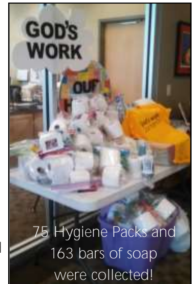
75 Hygiene Packs and 163 bars of soap were collected!