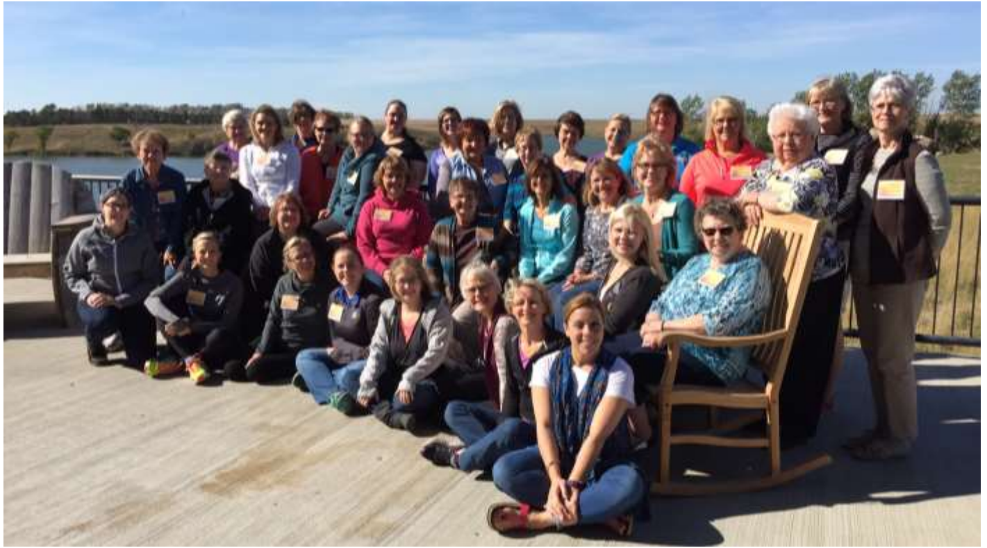
Women's Retreat at Joy Ranch—October 9-10 "Teach Us to Pray"