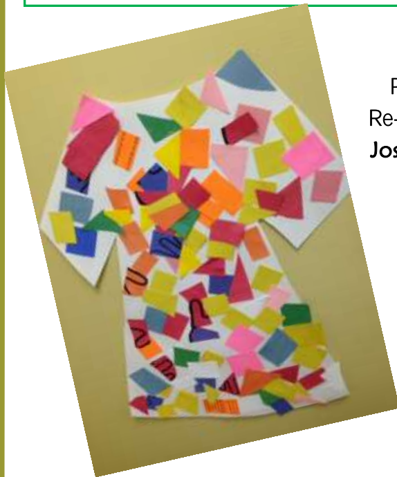
Preschool Re-creation of Joseph's Coat